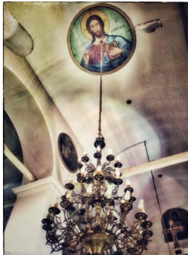
Original photograph manipulated with iPhone apps.