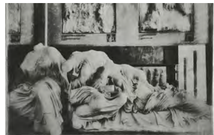
iPhone app image printed as a film positive and exposed onto a photopolymer plate. This was created at the Skopelos workshop in June 2017. From here there are many possibilities for advanced inking and printing techniques that will be part of the workshop at Agave Print Studio.