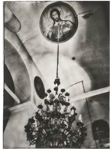
iPhone app image printed as a film positive and exposed onto a photopolymer plate. This was created at the Skopelos workshop in June 2017. Techniques such as inkjet chine collé and a la poupée inking will be demonstrated at Agave Print Studio.