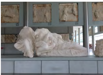
Original photograph taken in museum.