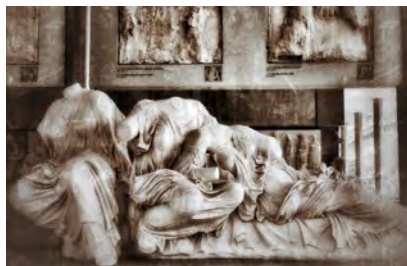
Original photograph manipulated with iPhone apps.